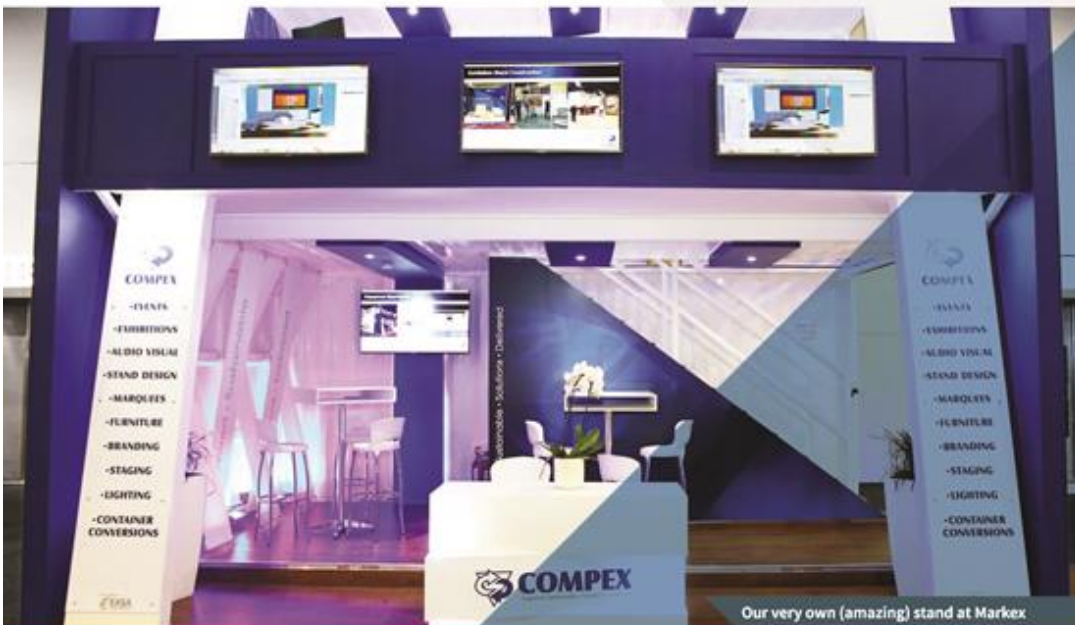
Our very own (amazing) stand at Markex

So you've booked your (boring) standard shell scheme exhibition package and have made a note to buy extra Prestik on your way home for the posters you intend to stick on your stand's walls... Don't worry, we won't judge you for taking this approach.